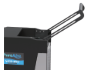
Fold- Down with Wheels for Transport