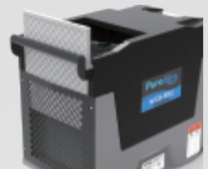
Easy Filter Access